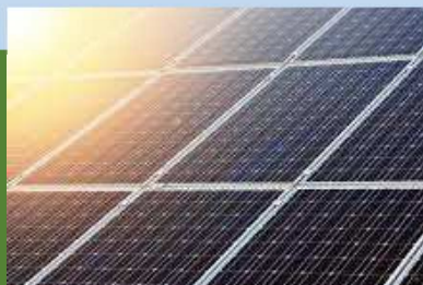
Photovoltaic system, covering company's needs and consumption