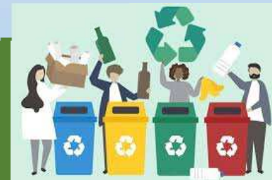
Staff awareness and environmental guidelines for waste disposal sorting