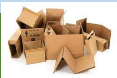
Recyclability of supplier packaging reduction of the consumption of wood, paper and cardboard