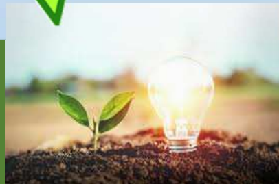
Led lighting system and power factor correction devices