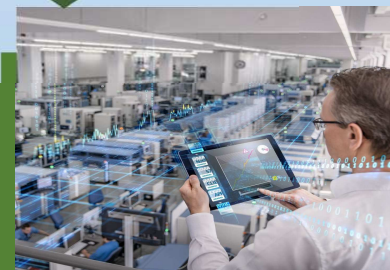
4.0 Industry ready for the achievement of the Smart Factory