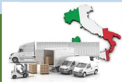
Reduction in freight transport consumption, thanks to the use of 0 km suppliers