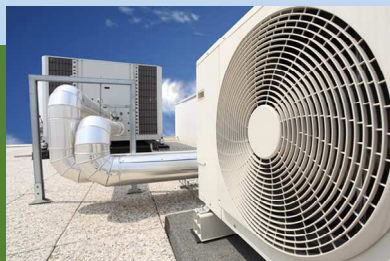
Latest generation air conditioning systems with temperature control