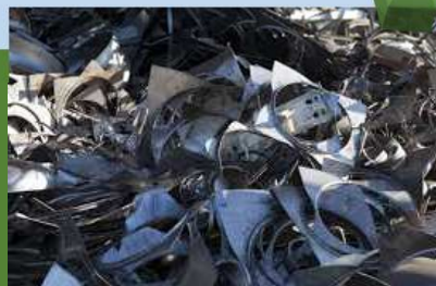
Recyclability materials of production waste